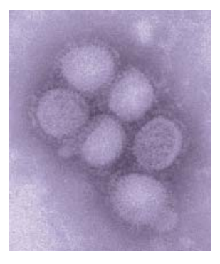
H1N1 Virus

Do not rely exclusively on television or radio newscasts for influenza information.