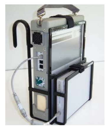
Fireedom Vent System