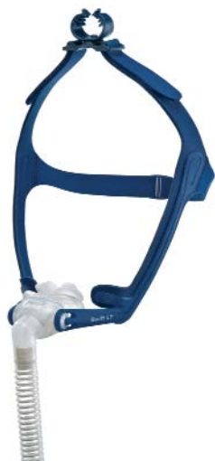
Swift™ LT by ResMed