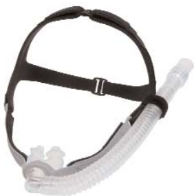
Opus® II by Fisher & Paykel: Vented