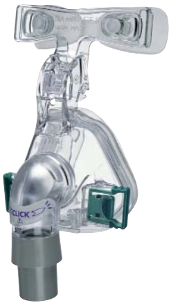
Ultra Mirage® II by ResMed: Non-vented

A. Vented masks cannot be used with volume-cycled ventilators, such as the LTV®950. Vented masks are specifically designed to be used with bilevel units. Only non-vented masks or vented masks with the vent sealed will work because the ventilator will detect the air leak and will alarm. The use of any type of nasal mask may also present a problem due to oral air leak that will also cause the ventilator to alarm. Ventilator alarming is often a problem when using volume-cycled ventilators for non-